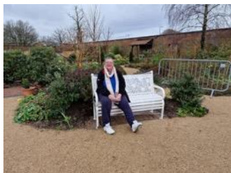
Below: Two benches in situ.