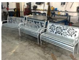
Left: after galvanising.

We hope you like our seating and shade improvements and will call in frequently to admire the garden and to rest a while in our newly commissioned comfort.