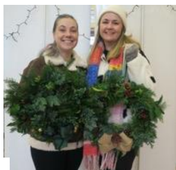
Wreath-making participants in action.

Once again, we were able to run a series of Christmas wreath making workshops over two weekends in December. It was a lot of work but our volunteers are becoming a well-oiled machine and despite a problem with the heating on the first weekend, they ran like clockwork. Many of the participants were returners from last year but we saw many new faces too. Everyone seemed to enjoy the sessions and we received excellent feedback from participants.