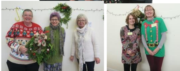
Above: Workshop tutors and runners.

We would like to extend our huge thanks to everyone who contributed and made this venture such a success. To our participants, thank you for coming, the funds raised by these events really help us keep the garden going. Thanks also to Aneurin Bevan University Health Board for permission to use the Recreation Hall at Llanfrecfa Grange.